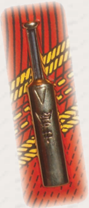
The Lord's Taverners Ireland Tie Pin Cost: €10.00 plus €2.00 p&p