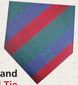
The Lord's Taverners Ireland Official Tie Cost: €25.00 plus €3.00 p&p